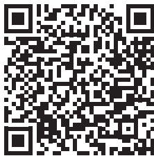
Kooken School Supply List