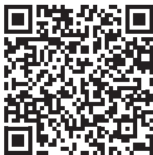
Thornton School Supply List